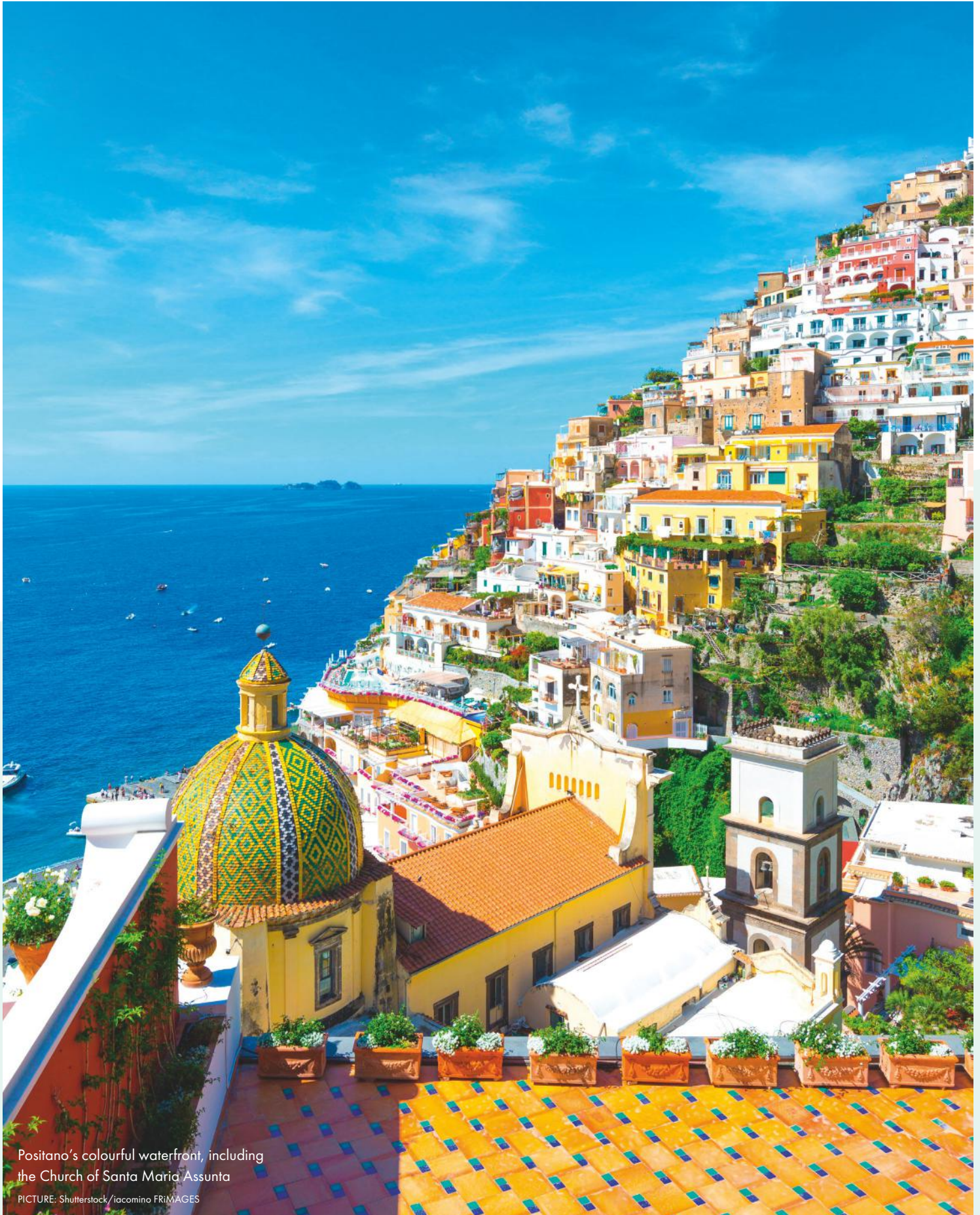
Positano's colourful waterfront, including the Church of Santa Maria Assunta